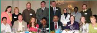
Gateway CC Foundation Donor/Scholar Lunch - May 18, 2010, New Haven Lawn Club