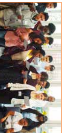
New Haven Promise students in attendance at the New Haven Promise Scholarship reception at Gateway Community College. Students recited the "pledge to complete their studies."

Beyond that, the Foundation works in concert with the College to sustain and grow an impressive network of community support, promoting public awareness and understanding of Gateway Community College as a significant regional resource. Initiatives and programs throughout the year reflect that ongoing relationship, and the benefits that accrue across the community.