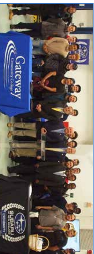
Subaru of New England and Gateway Community College co-signed an agreement to establish a Subaru University (Subaru-U) at Gateway Community College.

Also during the year, Gateway expanded an existing partnership with American Honda to begin offering the full "Honda PACT" degree and certificate program, and added the national Coalition of Certification Centers (NCC3) industry certifications in automotive diagnostics.